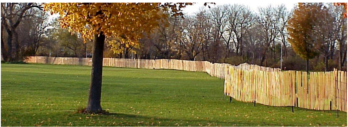
5. Use lines to lead eye into photo