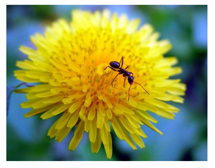
1. Get close