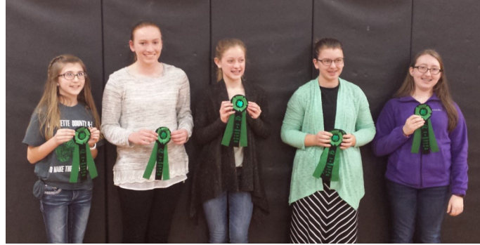
Top: Visual Arts special merits