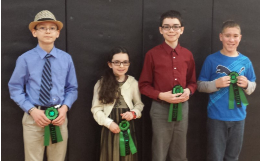
Top: Piano and Instrumental special merits