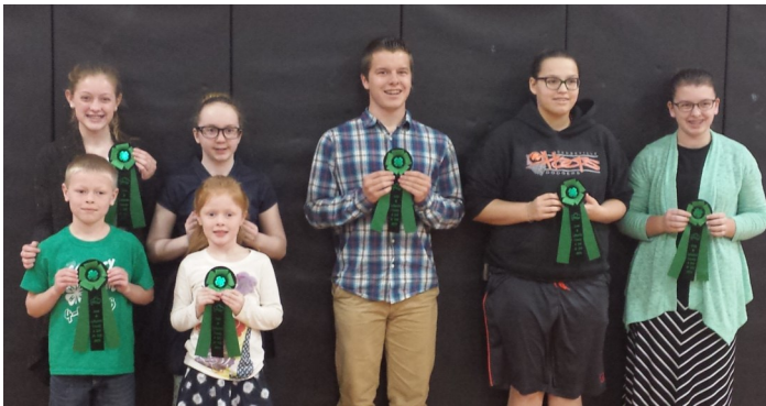
Bottom: Communication Arts special merits