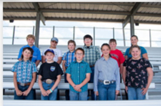
Junior Livestock Team