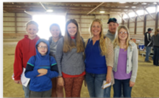
Junior Dairy Team