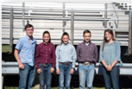
Senior Livestock Team

The 2021 State 4-H Livestock and Dairy Judging contest was held June 22 nd , and the results are in! Thanks to everyone who participated. We were so excited that the Iowa County teams in livestock judging in both Senior and Junior divisions placed 1 st in Wisconsin! Many thanks to the adult coaches who have mentored youth over years, allowing them to succeed at the state competition.